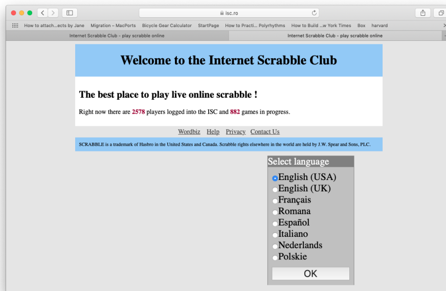
Figure 1: Window from a first visit to the ISC site.